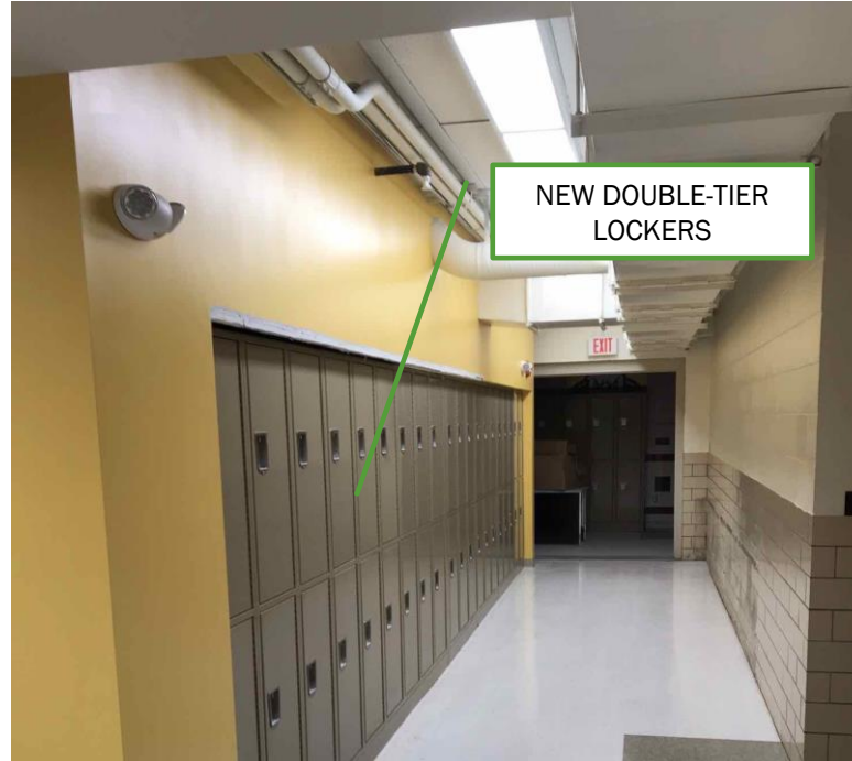
NEW DOUBLE-TIER LOCKERS