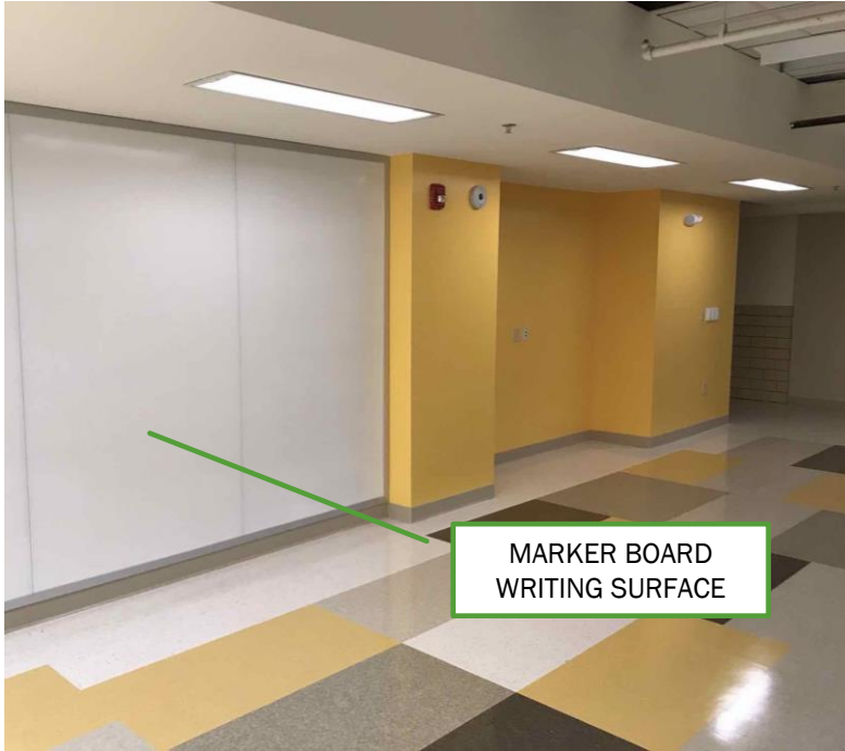
MARKER BOARD WRITING SURFACE