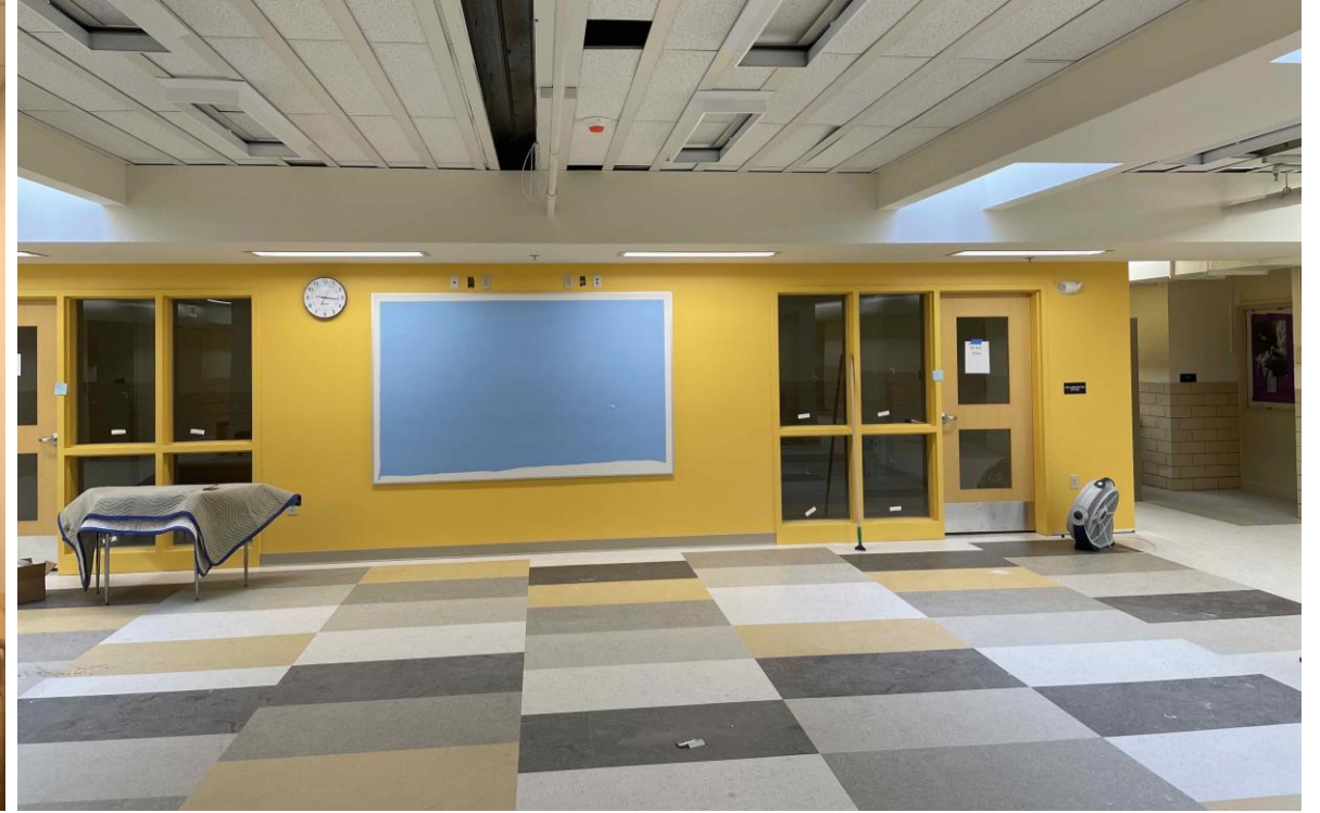
TYPICAL WORK ROOM & COLLABORATION OFFICE (6 TH GRADE WING PICTURED)